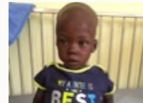
Kashme - 3 years old 17.5lbs