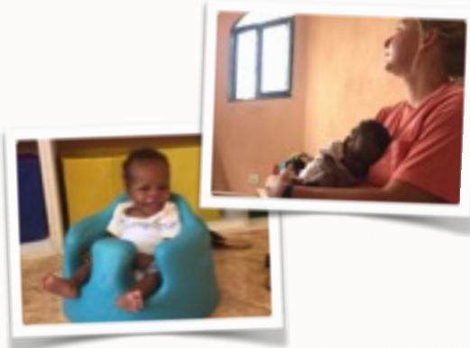
Children at Pen Lavi Malnutrition Center