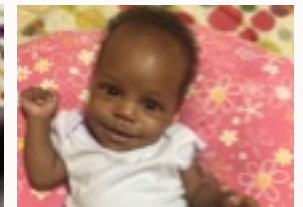
Holanda - 4 months old 10lbs